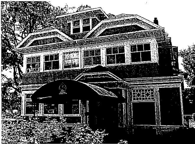
Open Meadow High School resides in a historic home built by Simon Benson on the Willamette River bank in North Portland. Founded in 1971, Open Meadow also includes a middle school and is among the oldest alternative schools in the Portland area.

"This is a golden opportunity to participate in education by supporting a school where the mission is to give kids a second chance," he said. "That aligns well with The Standard's tradition of lending a helping hand where it is really needed."