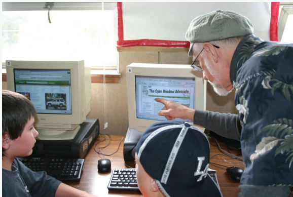
OMMS MEDIA STUDENTS AND TEACHER WORKING ON THE NEWSLETTER

Our Newsletter is about getting people together to create school news and to create a better community. It is also about finding out interesting facts and stories. The name of the newsletter is TOXIC RELIEF .